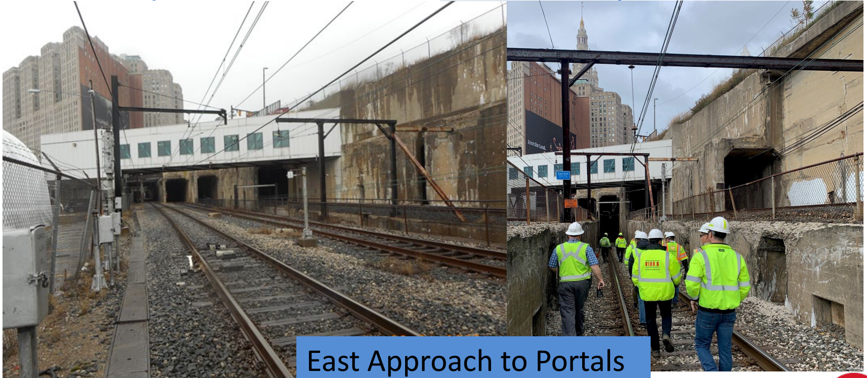
East Approach to Portals