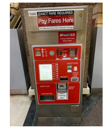
Ticket Vending Machine