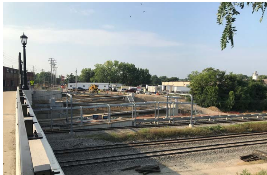
New Station: August 25, 2020