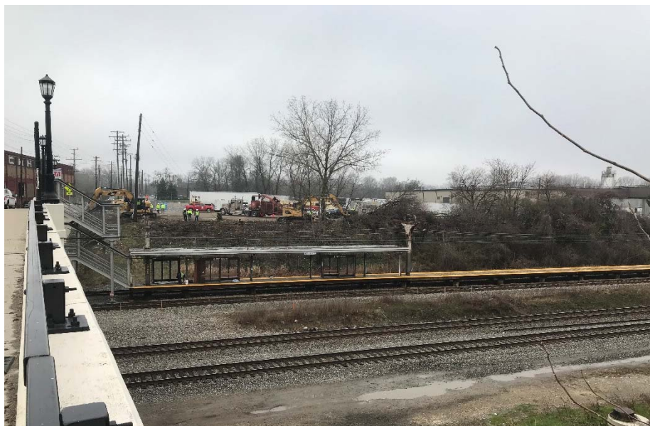
Original Station: April 8, 2020