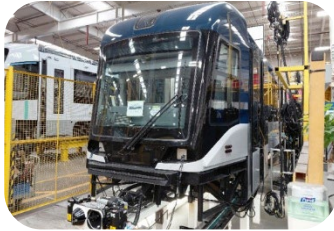
Electrical Resistance Testing