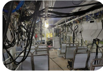
Electrical Resistance Testing