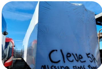
Floor Panels Awaiting Installation