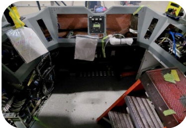
Cab Console Installation