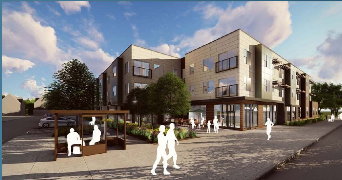
Aspen Place Apartments