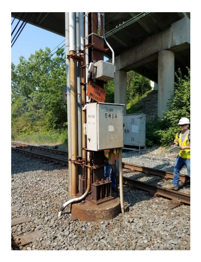
POLE WITH OBSTRUCTION