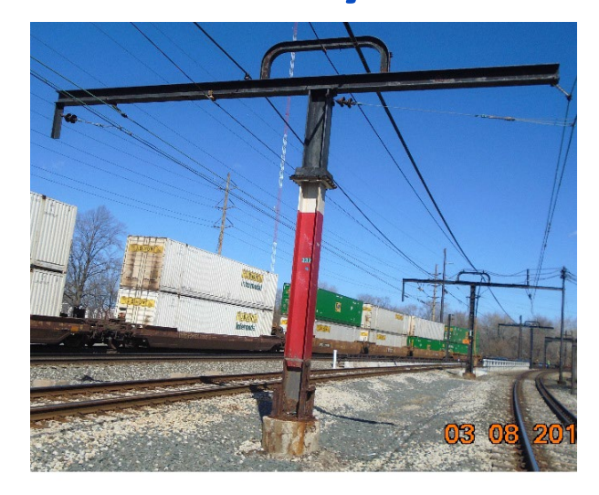
TYPICAL CATENARY POLE