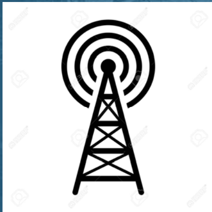
MARCS 13 Radio Towers