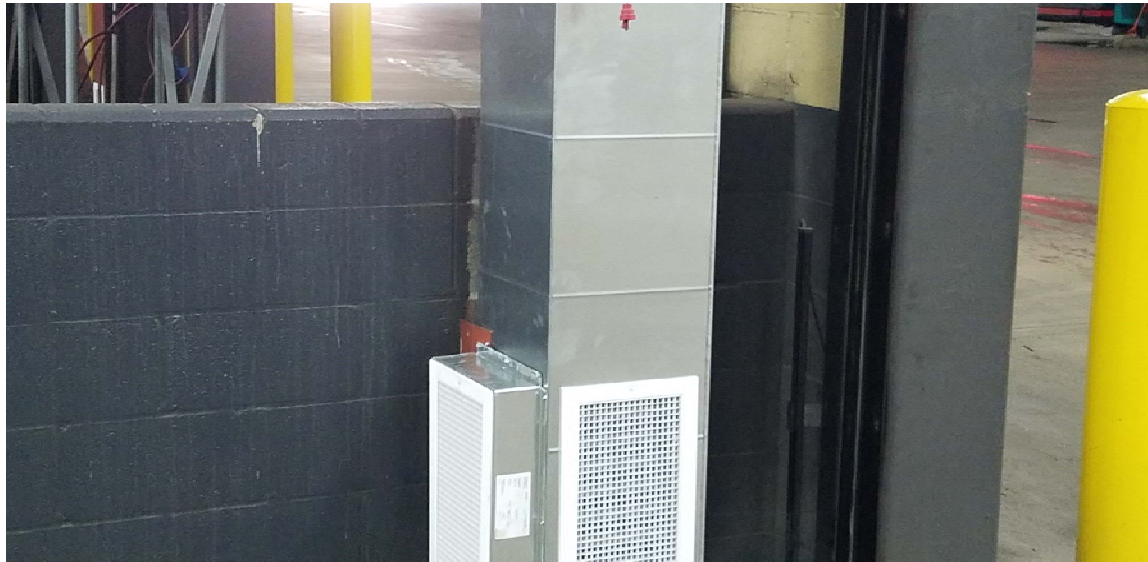
Modified Air Distribution