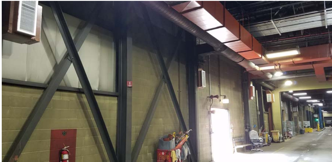
Modified Air Distribution