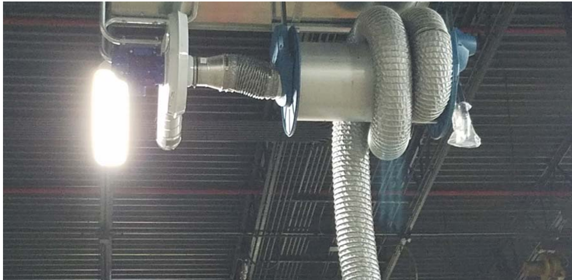
New Hose Reel