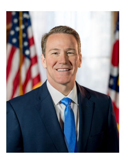
Lt. Governor Jon Husted