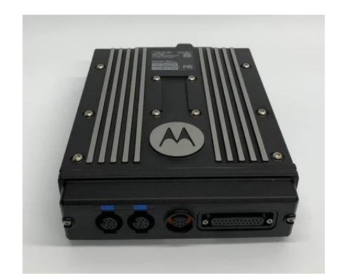
APX6500 Radio Chassis