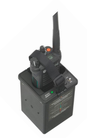
IMPRES Vehicle Charger