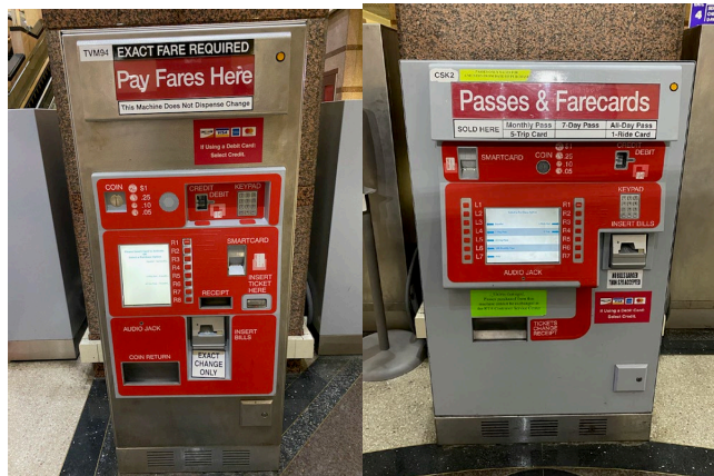
Ticket Vending Machines & Customer Service Kiosks