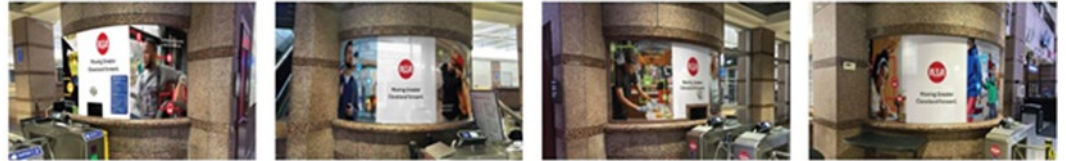
Tower City curved booth windows (above) to introduce the brand and brighten the central Customer Service area, and inviting Walkway windows (left)