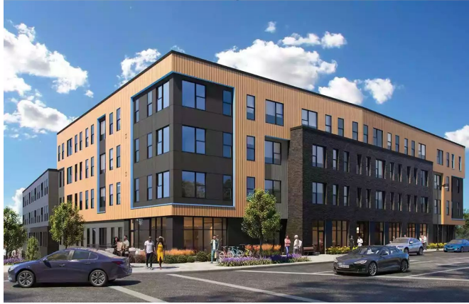
Woodhill Station East

May 15, 2026 | 9615 Buckeye Road, Cleveland