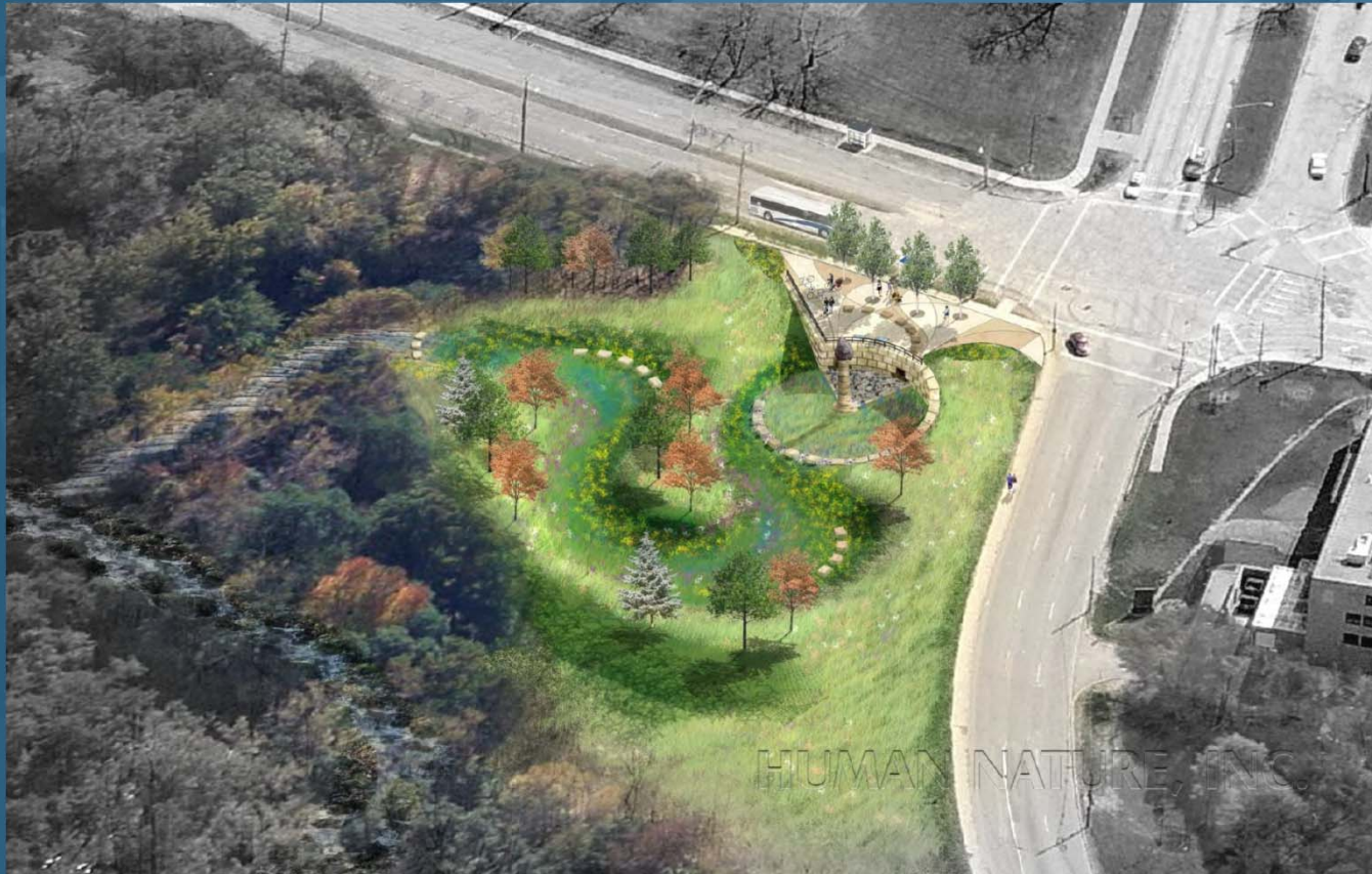
Ambler Park: Bioretention Basin Concept

Greater Cleveland Regional Transit Authority