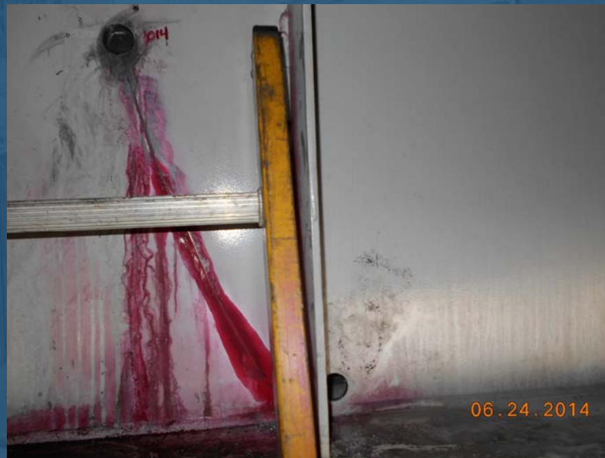
Second crack (2014)