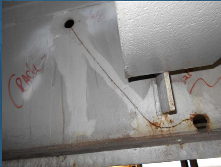
First crack (2005)