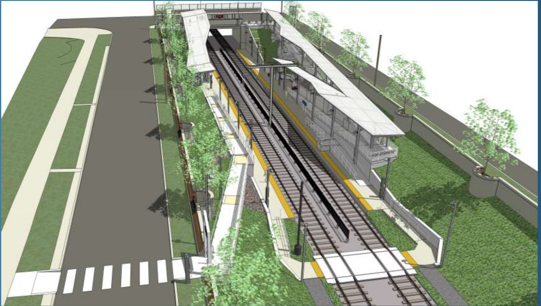
Aerial View – Looking East